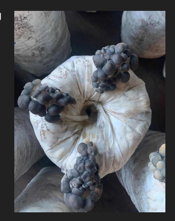
Start spraying water ~ and you will see baby mushrooms grow