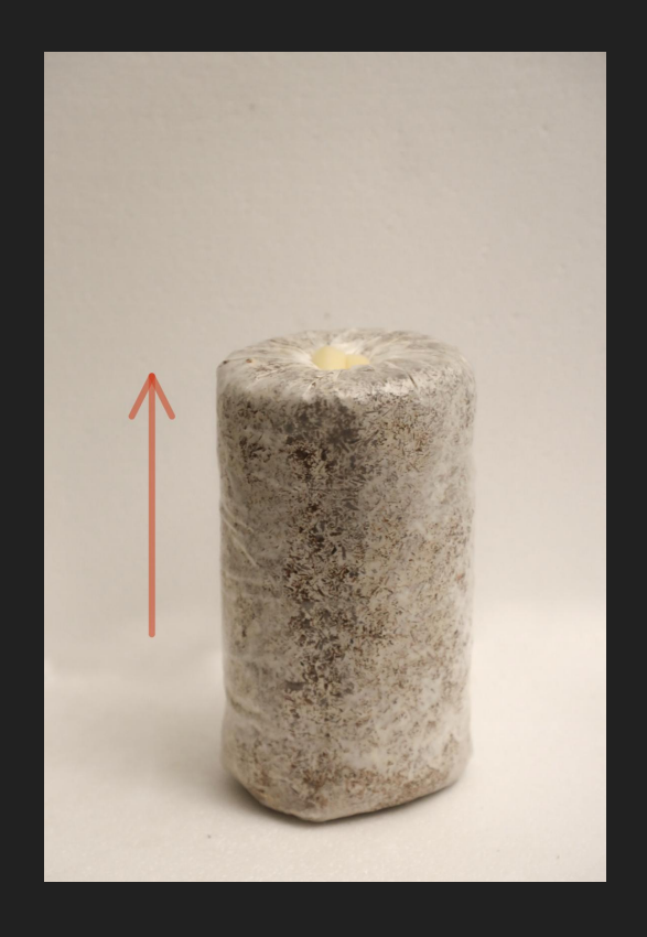
This side up